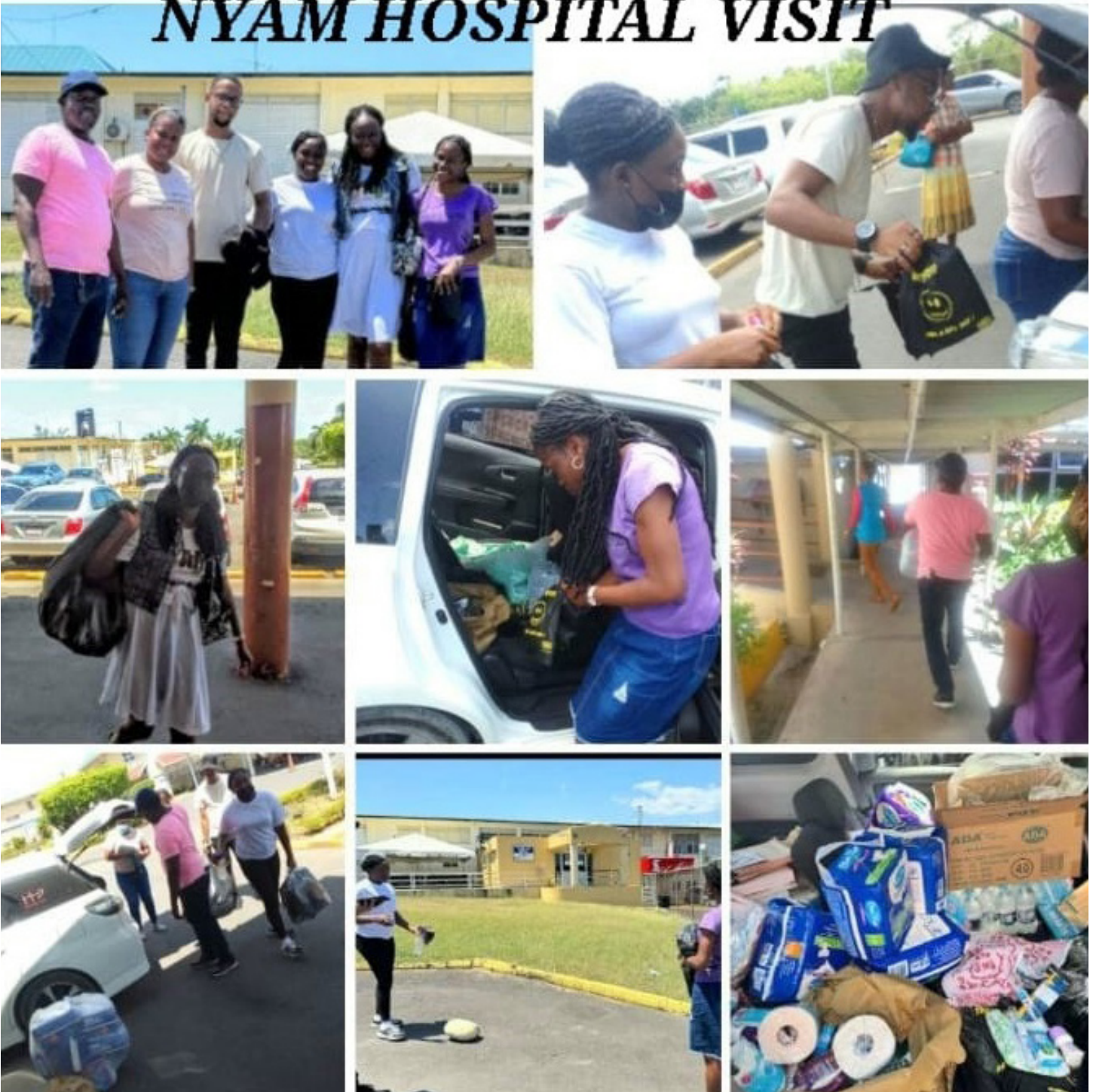
The National Young Adults Ministry's trip to the St Ann's Bay Regional Hospital on March 23, 2024. One patient indicated the need for salvation.