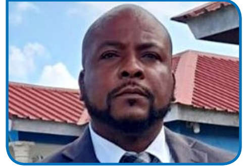
REVEREND RALSTON THOMPSON CLARK'S TOWN DISTRICT IN TRELAWNY