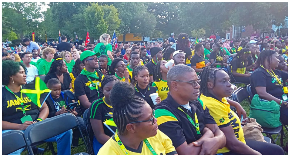
A section of the Jamaican contingent at the competition.

“The National Young Adult Ministry Retreat experience was an extraordinary one. For the spiritual areas, they created a magnificent impact on my life and also I had my fair share of enjoyment in the different various activities.