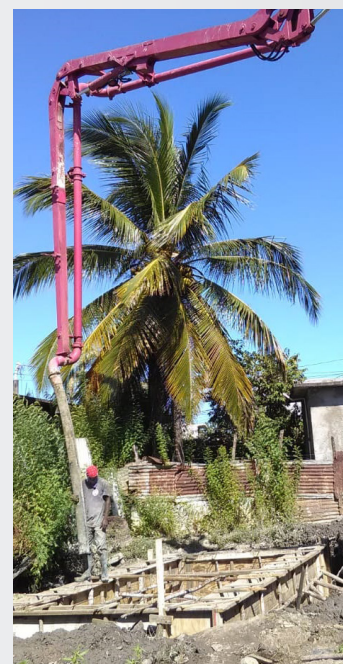
A project being undertaken at the Annotto Bay Church.

Established 20 years ago, the members currently worship in a dilapidated building. They are working hard to change their current