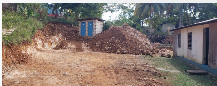
ABOVE AND AT TOP: The Ewarton Church.

The members began holding services in the Community Centre, then they had to move to the All-Age School. When COVID-19 hit, it became logistically impossible for them to continue holding services at