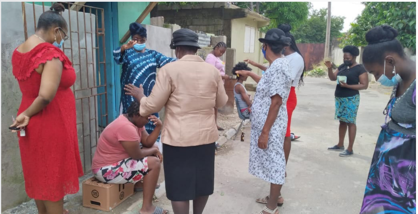
Members of the Waltham Park Road Church on an evangelistic mission.

If you are desirous of participating in this initiative, contact us at: sdbailey.ntcogja@gmail.com or call us 876-927-3712; 876-978-4058; 876-927-7767.