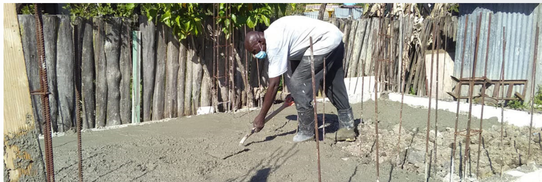
A construction project at the Annotto Bay Church.

Editor’s Note: If you would like to make a contribution toward this effort, please send email to sdbailey.ntcogja@gmail.com or call us at 876-927-3712, 876-978-4058 or 876-927-7767.